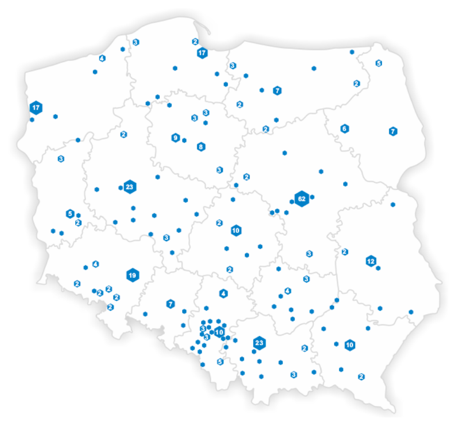
Fig. 1. Innovation and entrepreneurship centers in Poland in 2017 (leading institutions)

For the development of Polish biotechnology spin-offs and start-ups in the conditions of global competition, the overall innovation of the economy, processes of developing a knowledge-based economy and conditions for the commercialization of scientific research in Poland are important. Poland scored 68.16 points out of 100 on the 2018 Global Competitiveness Report published by the World Economic Forum. Competitiveness Index in Poland averaged 15.02 Points from 2007 until 2018, reaching an all-time high of 68.16 points in 2018 and a record low of 4.28 Points in 2008. The value obtained in the Innovation pillar assessing the environment conducive to innovative activity places Poland in the 37<sup>th</sup> position on the 140 countries studied [27].